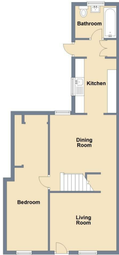
Ground Floor Approx. 57.0 sq. metres (613.7 sq. feet)